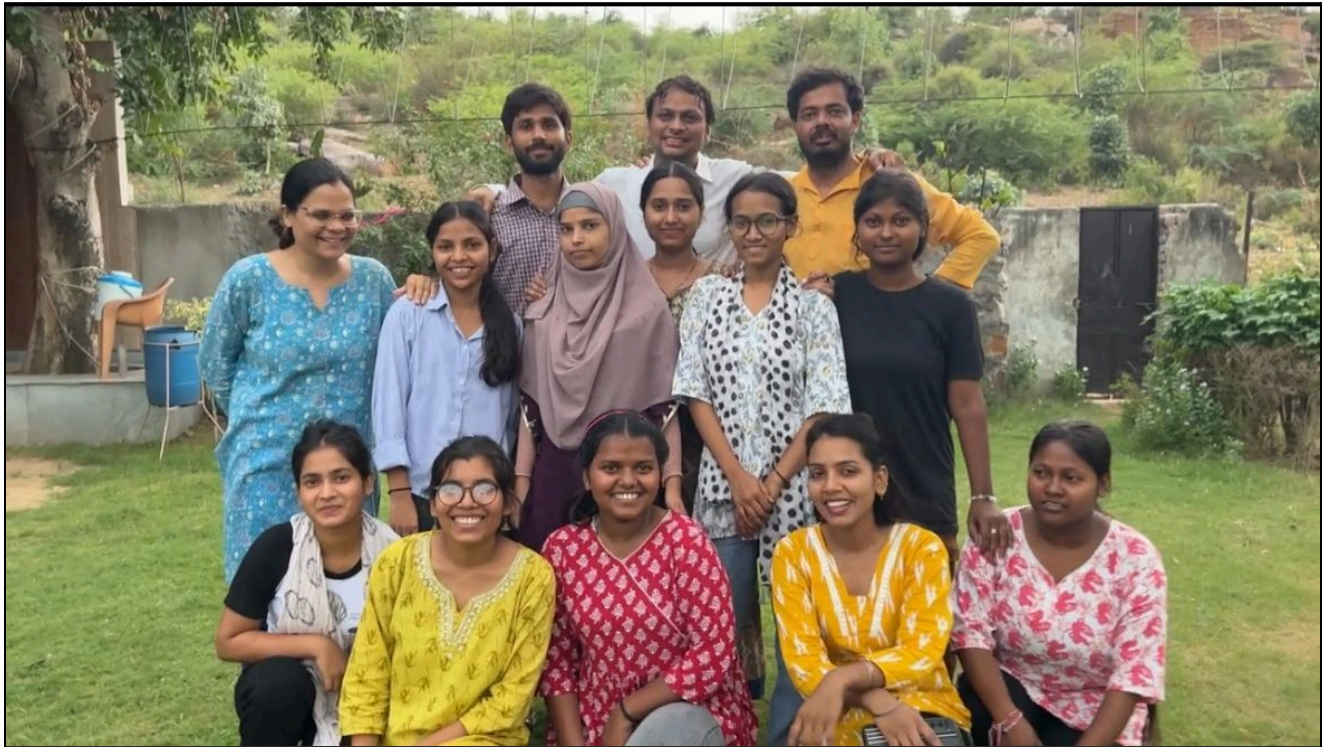
Our Team of Learning by Locals

This quarter, we took a pause from our daily work and came together for a refreshing Team Retreat . As an organization, it was a special time to revisit our goals , reflect on our journey, and remind ourselves why our work matters. We had meaningful conversations about our purpose, challenges, and the impact we want to create. The retreat also gave us a chance to connect with each other on a personal level , build stronger bonds, and simply enjoy being together outside of our usual roles. It was a powerful reminder that behind all the work, we are a team with shared dreams and a common mission.