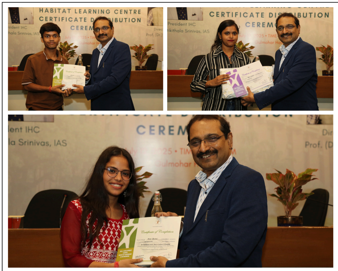
Our Students receiving completion certificates from HLC

Aside from the course curriculum, learning at HLC is an exciting experience for the students as it gives them the chance to interact with students from other NGOs, explore a new part of Delhi, attend various cultural events at the India Habitat Centre. This not only leads to their professional but also their personal growth.