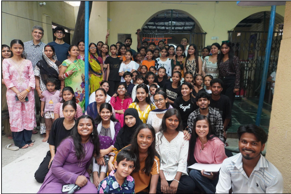
Hunarbaaz -8 (Talent show)