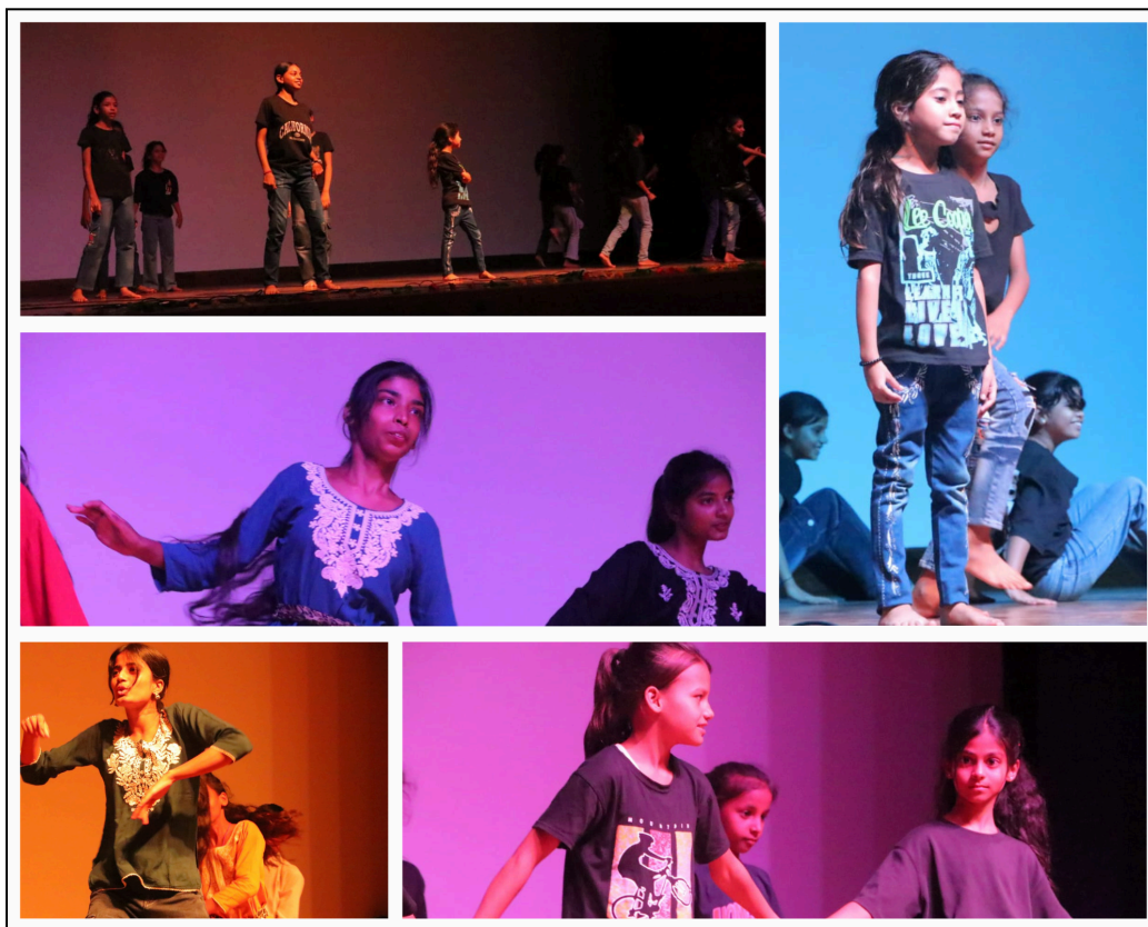
YUVAAJ - YUVA KI AWAJ

The energy of the students, the support from the community, and the platform to express themselves made YUVAAJ a truly powerful experience. We are grateful to Manzil Media Lab for creating this space and for reminding us how important it is to listen to and celebrate young voices.